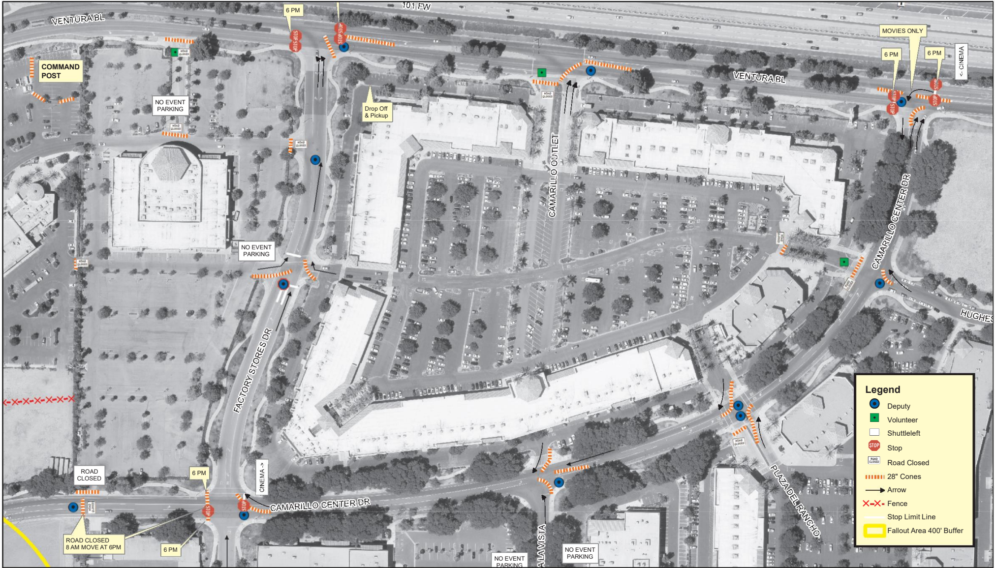
Traffic Control - Main & Fashion Ct