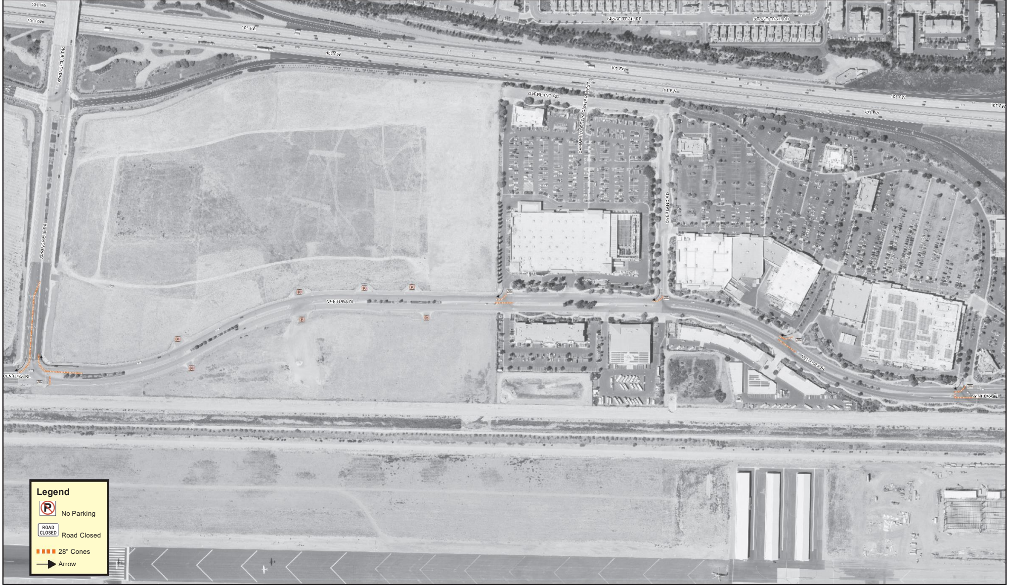
Traffic Control - Springville